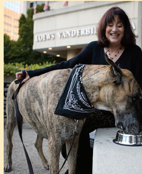
Guests enjoy our Rex in the City event series on the patio at Loews Vanderbilt Hotel.